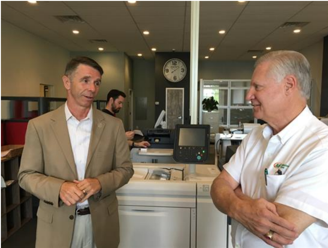
I visited with Minuteman Press in Ashland to hear how their business has benefited from the work Congress has done to bring our our booming economy.