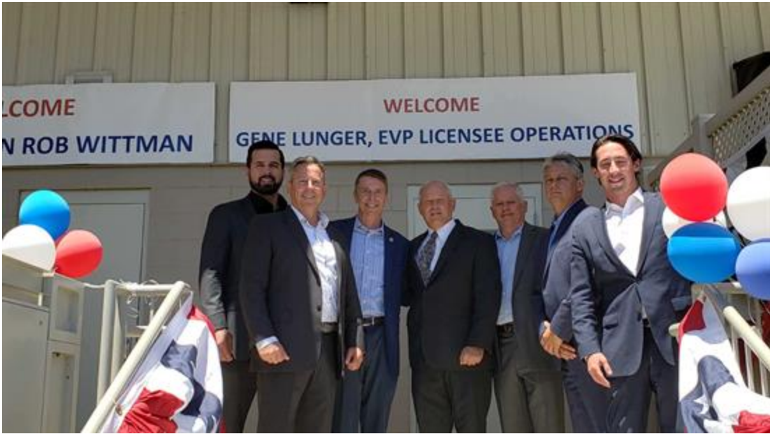
I toured Trivett's Furniture in Fredericksburg and spoke with folks about how Congress is working to get government out of the way so small businesses can succeed.