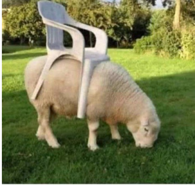
Riding Lawnmower $300