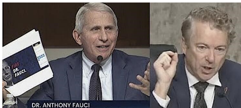
Fauci and Sen. Rand Paul, facing off in the public arena. “He definitely misled the senator,” said the ex-head of the CDC.

But while dissembling to the media is not a crime, lying to Congress is illegal. And the Department of Justice has two referrals from Congress already requesting that Fauci be prosecuted for lying under oath.