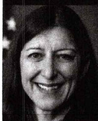
ELAINE LURIA (DEMOCRAT)